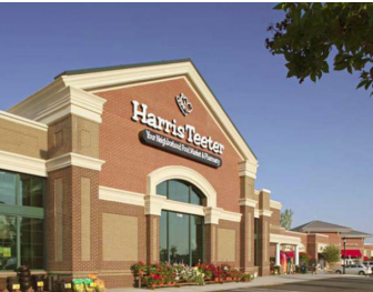
Cary Park Town Center Cary, NC Retail - REIF I