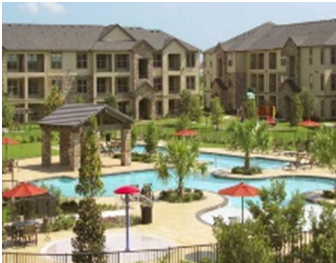
Discovery at Shadow Creek Pearland, TX Multifamily - REIF II