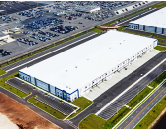
Florida Gateway Jacksonville, FL Industrial - REIF III