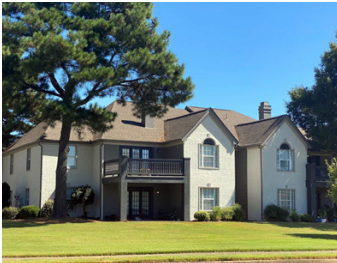
Addison at Collierville Collierville, TN Multifamily - REEV I

Our dedicated team of real estate professionals is available to assist with clients’ external real estate queries. The BBHRE platform brings real-time data and creative solutions while leveraging the broader BBH network in the decision-making process.