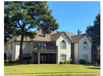
Addison at Collierville Collierville, TN Multifamily - REEV I