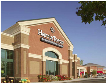
Cary Park Town Center Cary, NC Retail - REIF I